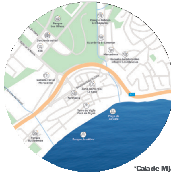
*Cala de Mijas

And just 30 minutes away are the airport and the city of Málaga.